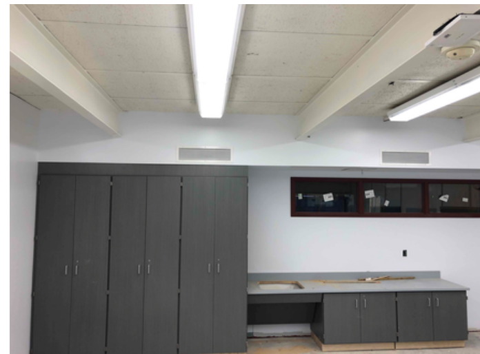
Millard Hawk Classroom