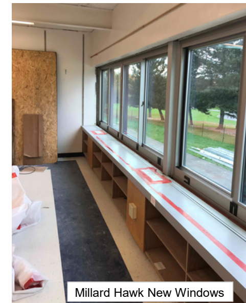
Millard Hawk New Windows