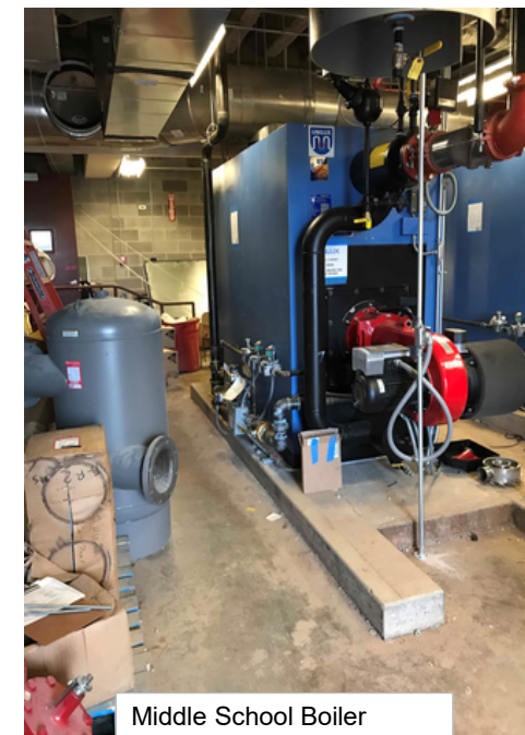
Middle School Boiler