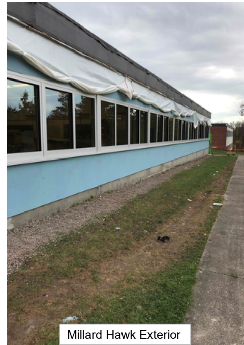
Millard Hawk Exterior