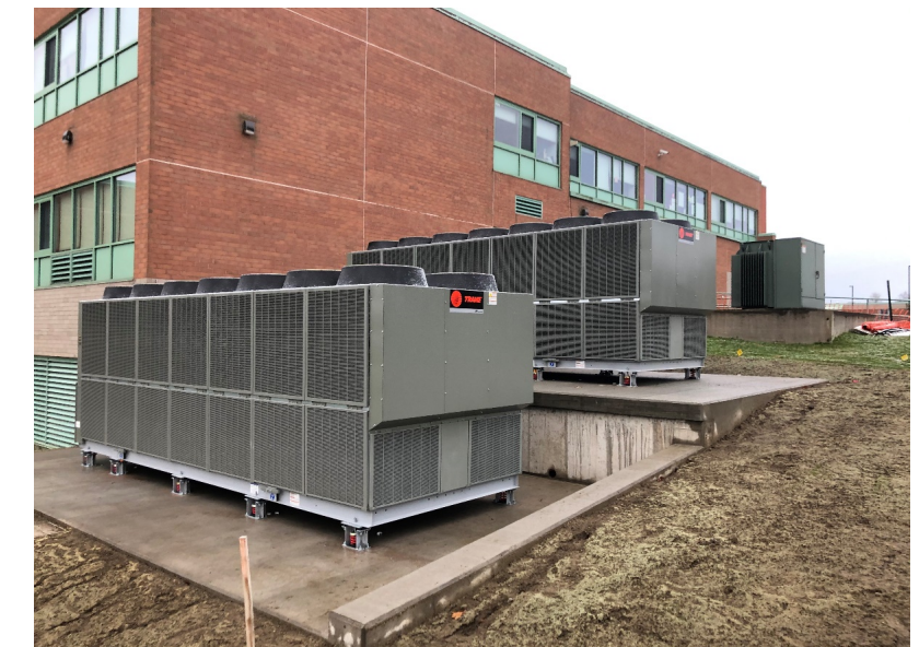
Middle School Chillers